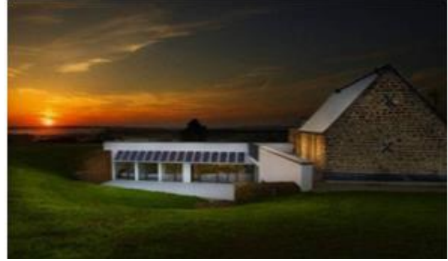
Fig.5. Sedum House villa [19]

waterproof. Besides, it also contributes to the solidness of the whole structure of the house.