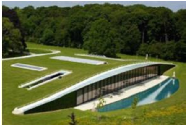
Fig.1. Holmewood House villa [19]

grass, and beech trees. The roof of the villa is solid enough to bear the pressure from lawns, soil, and driving tractors. With its transparent ceiling, everything on the roof is visible to the interior of the house, which is why the roof is called "green roof". In the center of the house is there a patio. The floor of the house is movable which can be turned into a swimming pool in seconds with a touch of button. The inner wall is completely built with carefully selected French lime stone. Besides, the power switches and media control system boards are made according to the texture of stone. By splicing the stones and the boards together seamlessly, the wall itself is entirely waterproof. Thanks to its flexibility, this underground villa as a private dwelling has been used to hold various kinds of conferences.