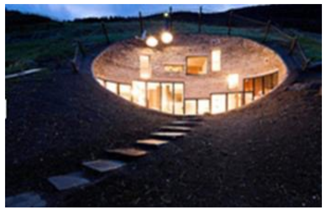
Fig.2. Villa Vals villa [19]

Villa Vals (figure 2) is located under a slope on the Alps with an altitude of 1250 meters, in the southeast of Switzerland. As swiss law expressly stipulates that modern architecture is prohibited on any mountainside, the architects turned to building the house underground by drawing on the experience of Upper Cave Man. The building, as result, has become a part of nature and blends itself well to its surrounding vegetation and the sky. The whole house is mainly built with stone and wood. The opening was designed as a sunken sphere, in order to make the patio more spacious. On the other hand, they excavated a subterranean tunnel for entering and exiting, so that there would not be any man-traces on the slope.