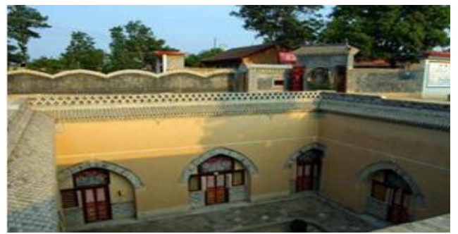
Fig.9. Sunken cave [19]