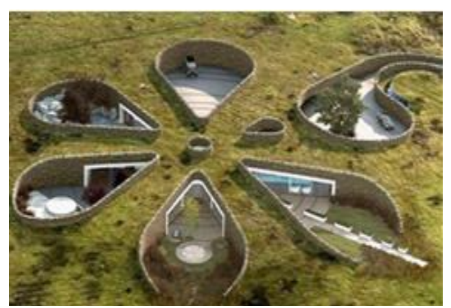
Fig.4. The petals Villa [19]

Flower Petals in Bolton, U.K. (figure 4) is a rural ecofriendly underground villa built under a hillside. Its roof is connected to the surrounding lawns seamlessly. A certain gradient was designed in order to obtain a good view of the outside in the villa below the ground. Flower Petals is composed of one central house and six functional houses. As a modern residence equipped with high technology, the villa generates electricity with wind power and solar energy, and operates the heating system with pumps, leading to zero carbon emission. Unlike the traditional quadrate homes which are built with all bricks and concretes, Flower Petals is so eco-friendly that mankind is able to live closer to the nature, which makes it stand out.