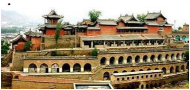
Fig.10. Detached cave [19]

Detached cave-house (figure 10), which is also named bracing cave-house, is a type of earth sheltered architecture. It varies a lot in terms of its style, including soil-arched style, brick-arched style, stone-arched style, and wood-arched style. In addition, detached cave-house can be either singlestorey or multi-storeyed.