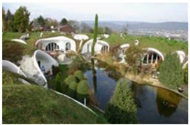
Fig.3. Earth House Estate Lättenstrasse [19]

been widely accepted. Estate Lättenstrasse (figure 3) in Dietikon, Switzerland designed by Peter Vetsch is a typical representative of Earth Home. This underground building is formed of nine houses which are joined together with stairs. It is well suited to the terrain around it, which makes it more protected from rain, wind, extreme temperatures and abrasion compared with traditional buildings on ground.