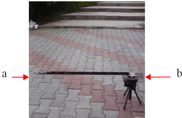
Fig.1 The first albedometer

The first albedometer with photovoltaic cells has the following components [1], see Fig.1: