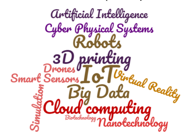
Fig. 3. The most cited disruptive technologies between 2011 and 2019 – adapted from Bongomin et al. (2020) [19]

The Industry 4.0 laboratory (Lab. 4.0) uses the fourth industrial revolution technologies to promote an environment where the students can change the process and see the results immediately. The selected technologies are well related to the disruptive technologies most cited in the literature between 2011 and 2019, according to Bongomin et al. (2020) [19]. Fig. 3 is a cloud representation where the size of words is related to the number of citations in a comparative way.